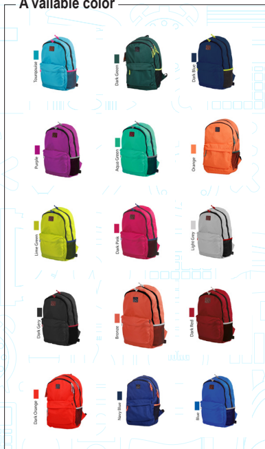
A available color