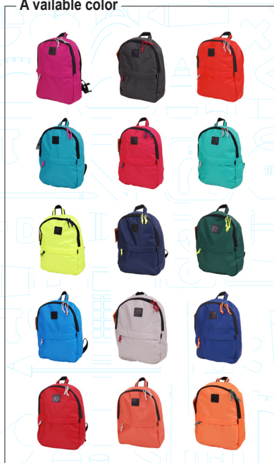
A available color