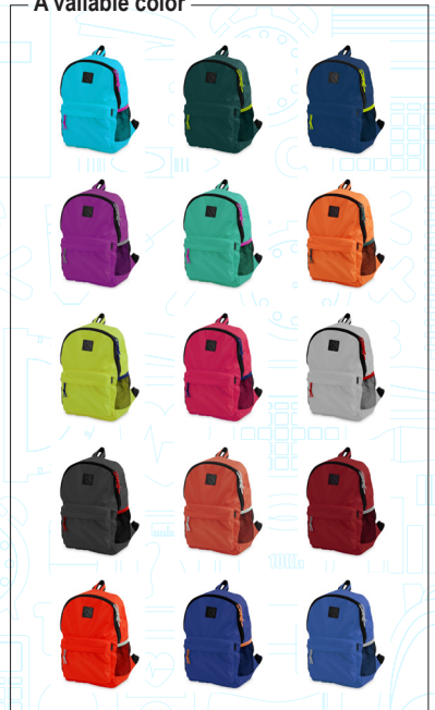
A available color