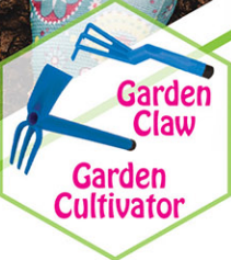
Garden Claw Garden Cultivator

A hand cultivator/hoe is used to break up and turn the soil where you will plant and for removing weeds. It can also be used like a small plow to dig the planting rows.