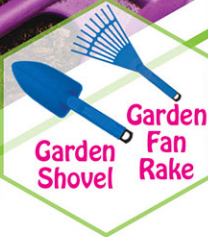
Garden Fan Rake Garden Shovel

The shovel/trowel offers precision for digging in small places. If you plan to plant flowers or vegetables in your pots, or even in your yard, you will need a hand shovel to ensure proper digging of holes.